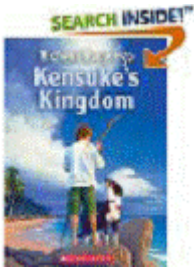
Kensuke's Kingdom by Michael Morpurgo ISBN# 0-439-59181-3

Grammar and vocabulary texts will be ordered by the school; students will be billed after they are distributed. Students may purchase or borrow a hand-me-down grammar book, as grammar exercises are not written in the text itself. This sort of exchange is not facilitated by the school, but arranged on a student-to-student basis.