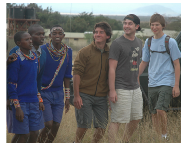
Highland Meets Enkijape