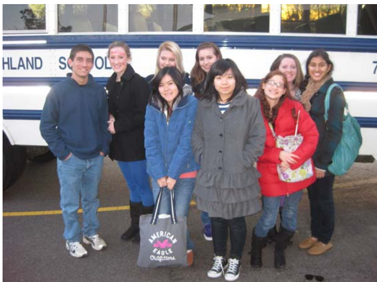
Members of the Asian Culture Club and additional students enjoyed this past Sunday in DC celebrating the Chinese New Year in Chinatown.

All of these experiences enlighten and enrich us. The inter-disciplinary approach, combined with the discussion of real 21 st century problems, makes the learning